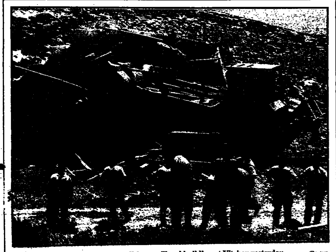
Police look on as a bulldozer demolishes an illegal building at Yitzhar yesterday.